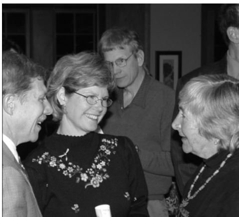
Wine, Dine and Celebrate The Conservancy Turns 10