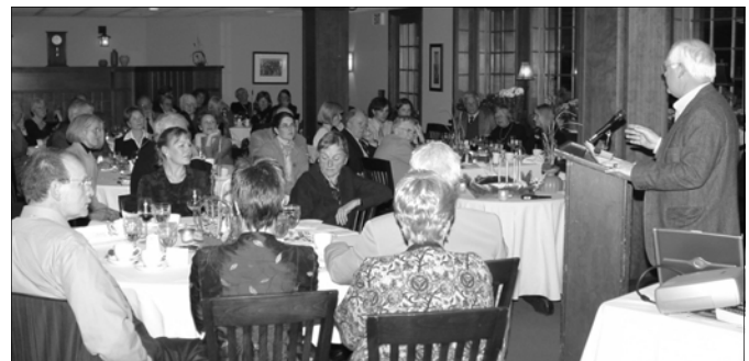
Remarks by Congressman Don Sherwood