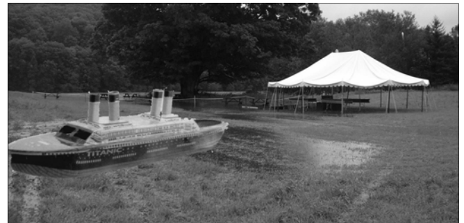
The best laid plans.....