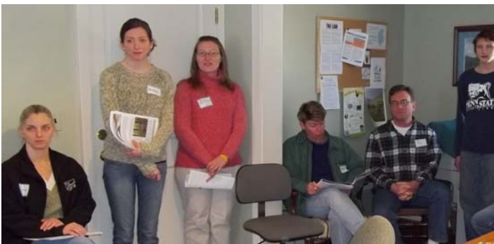
Eager volunteers learn how they can help