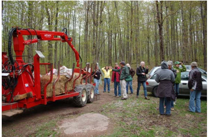
A workshop focused on sustainable forestry.

Women and their Woods is not a new concept. Women landowner groups across the country are becoming more and more active, including the Women Owning Woodlands Network in Oregon and the Women's Woodland Network in Minnesota.