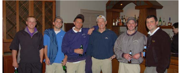
Happy Golfers at the Bar post Tournament