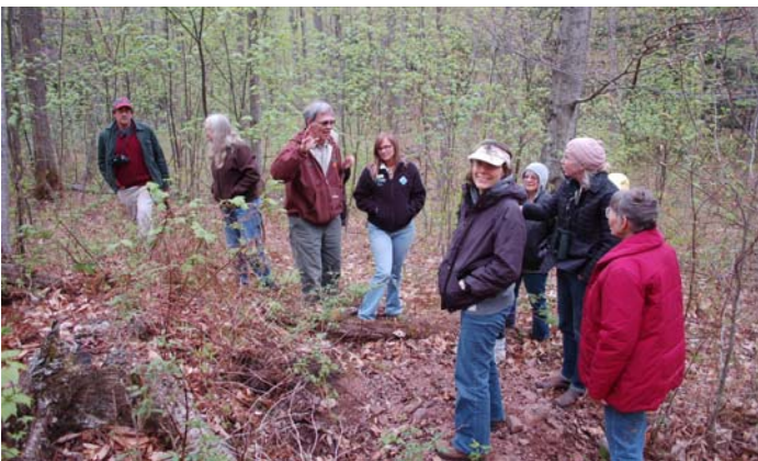
Women forest owners explore a certified family tree farm.

The increasing interest in these women's groups has led the Conservancy, with the financial support of the US Forest Service at Grey Towers and PA DCNR's Bureau of Recreation and Conservation, to partner with Penn State Natural Resources Extension to offer outreach and education to women forest landowners.