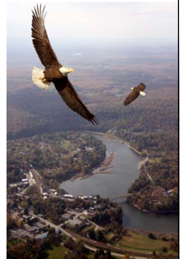
Early Bird Prize

EARLY BIRD DRAW to be drawn August 1, 2011