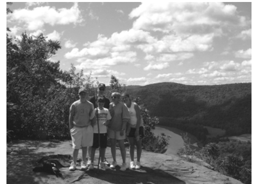
View from the Ledges

Follow a NY State Forest trail uphill to a magnificent view of the Delaware River and the valley beyond. Bring your lunch and eat by a waterfall. End up in Long Eddy with a stop at the Basket Historical Society to hear about bluestone quarrying. Call the office for further details.