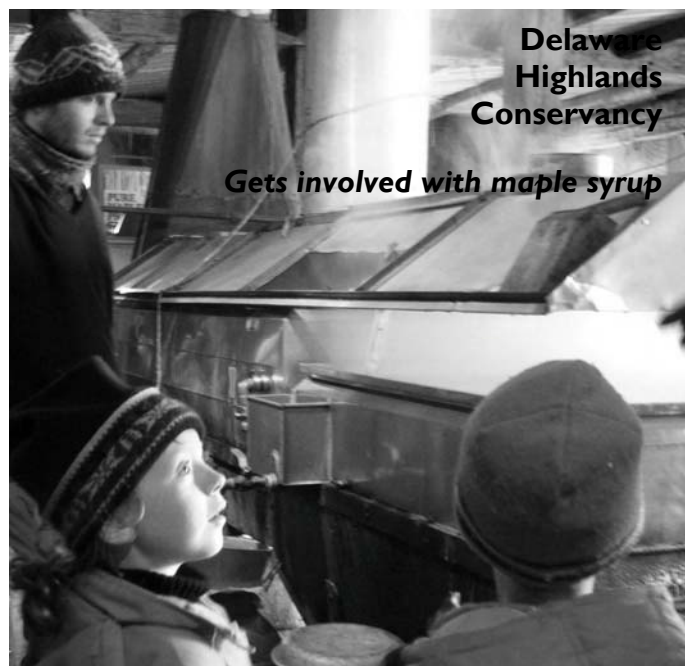
Delaware Highlands Conservancy

The Conservancy became the fiscal sponsor of the Public Television documentary "Nature's Keepers". The film focuses on the people of Pike County who are working to educate and mobilize their community toward action on behalf of the land and the place they love. Nature's Keepers will air on more than 150 public television stations, sharing a powerful message about Pike County's experience, one that can be a model for other communities struggling with similar issues.