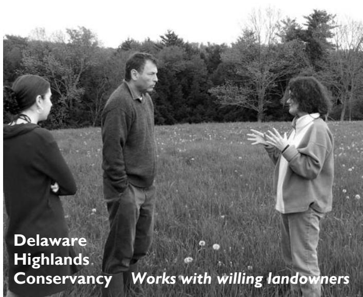
Delaware Highlands Conservancy Works with willing landowners

Working with Sullivan County's Ag and Markets Board, the Sullivan Planning Office and Cornell Cooperative Extension, a 230-acre farm in Jeffersonville was awarded a grant of $836,000 for the purchase of development rights. We are working with the Open Space Institute on the easement now and hope to have it completed by the end of 2007.