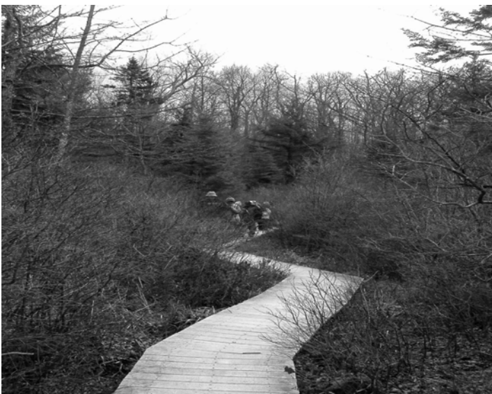
Wetland path into Camp Speers-Eljabar's easement land

In 2008, we signed a contract with Pike County to help municipal officials acquire funds for land acquisition or to draft easements to protect open space and properties with conservation value. We also worked with government and citizen groups who seek to ensure the environmental health and natural beauty of the region. In one example we worked with the Pike County Conservation District and Delaware Township Supervisors to produce " Pike County: Where Land and Water Meet, " a newspaper story about the value of conserving land. 15,000 copies were inserted in local newspapers. This project was funded by the League of Women Voters and the Pennsylvania Citizen Education Fund.