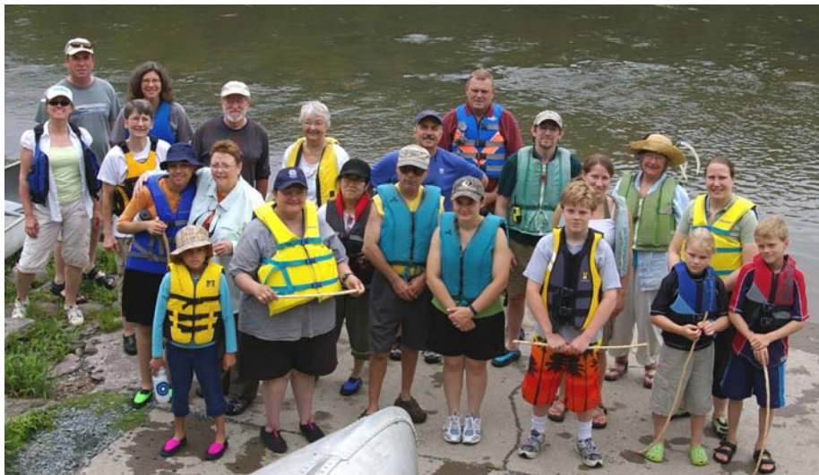
Ready to cast off