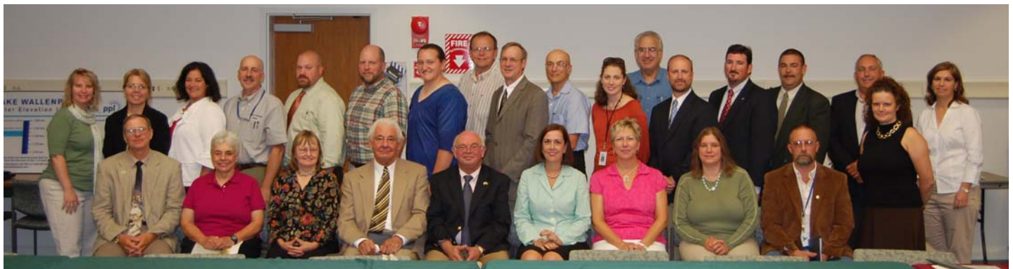
Pike Wayne Conservation Partnership Legislative Breakfast Another Success