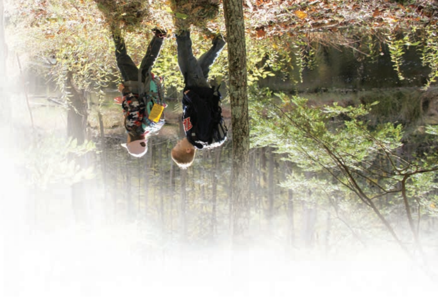
FRONT COVER PHOTO: ©STEPHEN DAVIS.

Non-Profit Org. Hawley, PA U.S. Postage PAID Permit No. 42