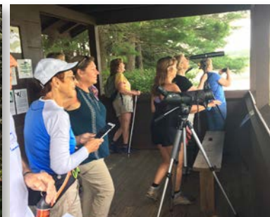
Attendees enjoyed a special educational event in celebration of our 25th anniversary: a summer day of paddling, hiking, and looking for nesting bald eagles at Promised Land State Park in Greentown, PA.