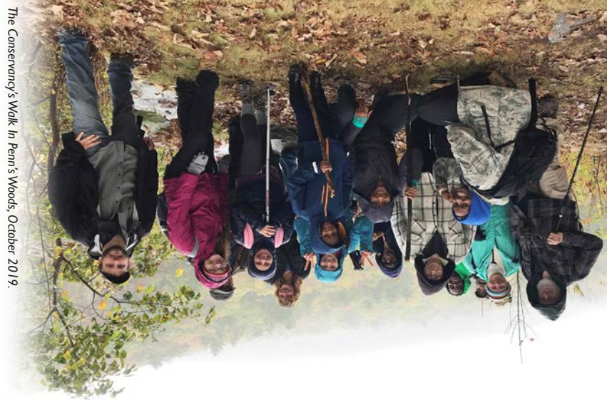
The Conservancy's Walk In Penn's Woods, October 2019.