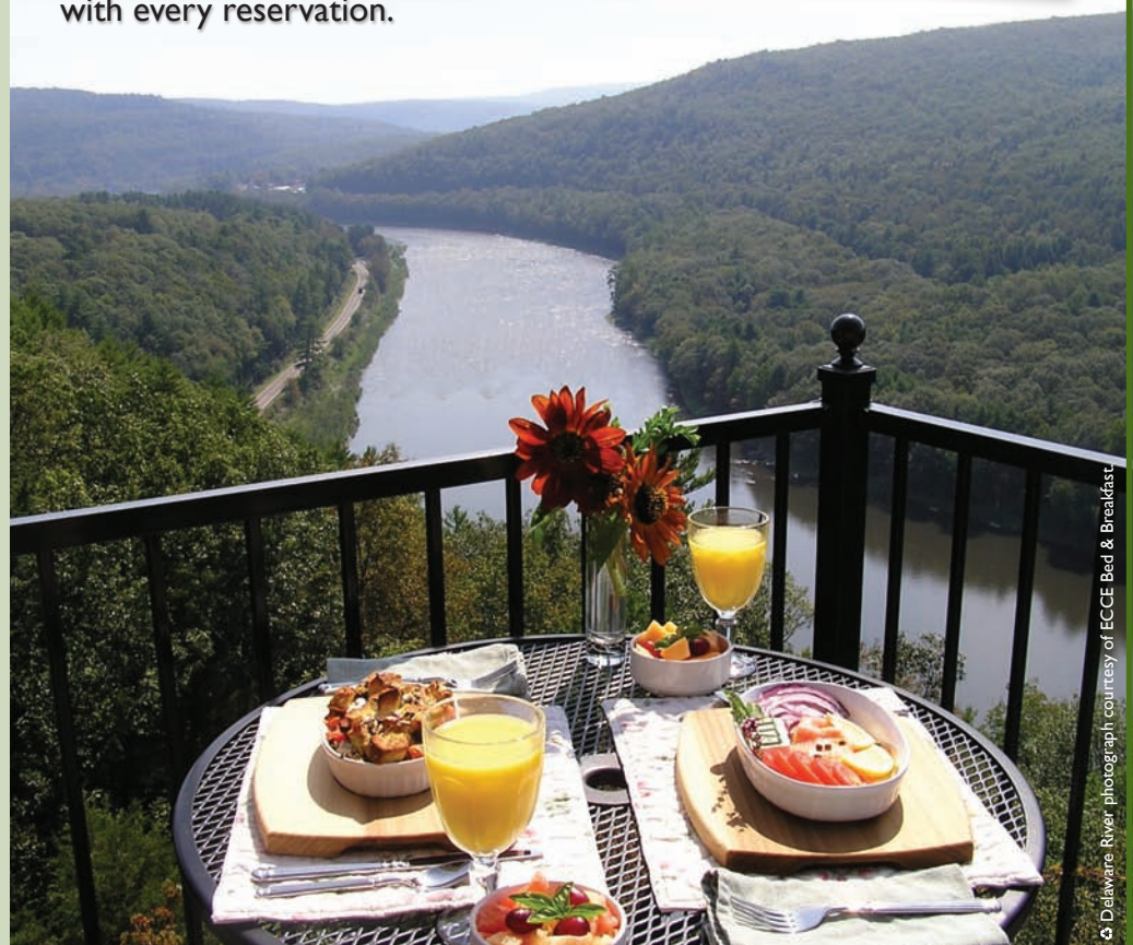
Delaware River photograph